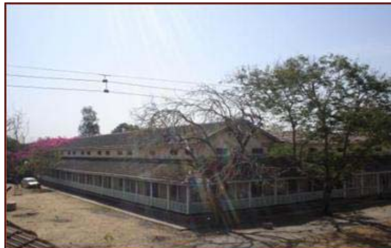
Lady Jacon Railway Hospital. Dahod