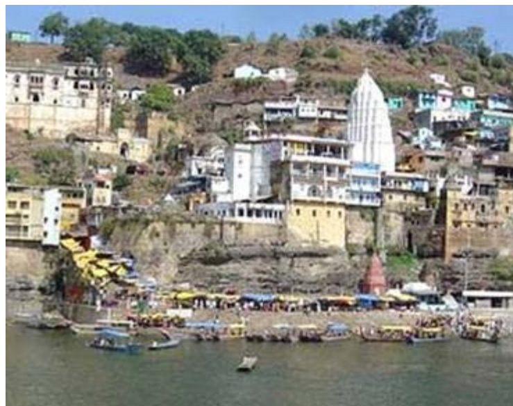
Omkareshwar Temple of Madhya Pradesh