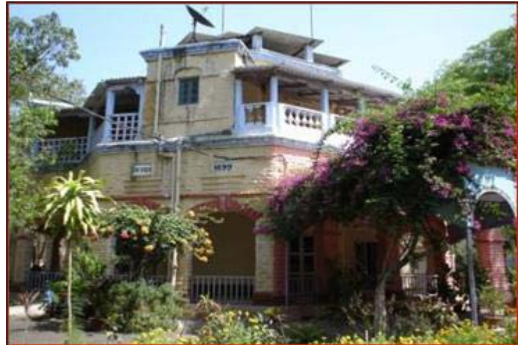
Divisional Rail Manager 's Bungalow, Ratlam. Year of Construction 1899