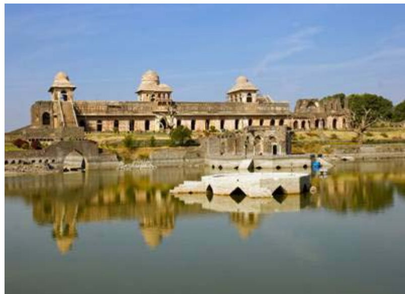
Mandu Mahal of Madhya Pradesh