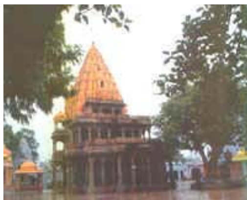
Mahakal Temple Ujjain