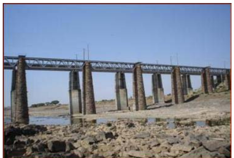
Anas Bridge No.142 on BG up line. Year of construction 1895