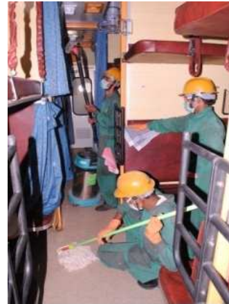
Mechanized Cleaning of Primary maintained trains