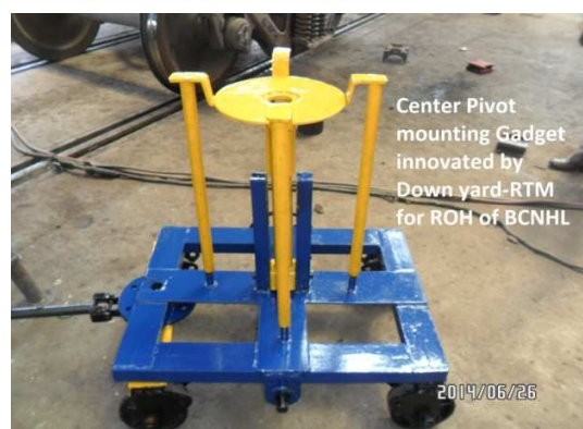
Center Pivot mounting Gadget innovated by Down yard-RTM for ROH of BCNHL