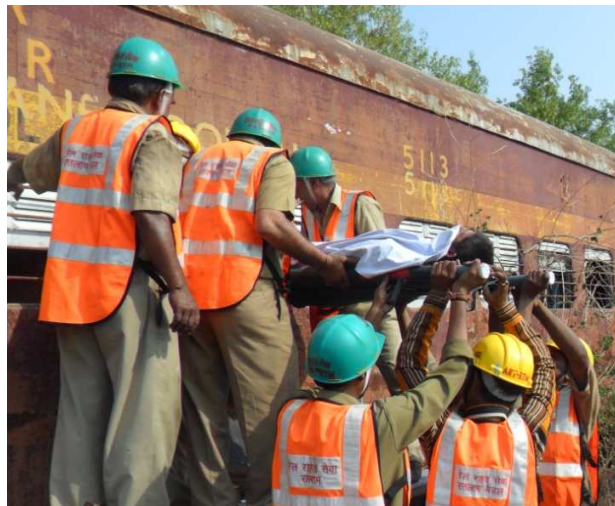
Coach cutting trial of Break down staff for rescue operation