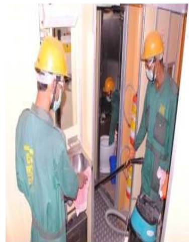
Mechanized Cleaning of Primary maintained trains