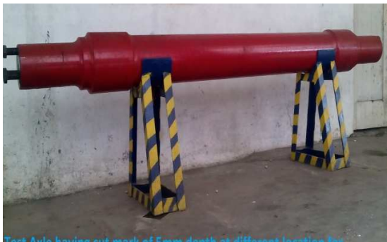
Test Axle having cut mark of 5mm depth at different location for Calibration of Ultrasonic Flaw detection machine