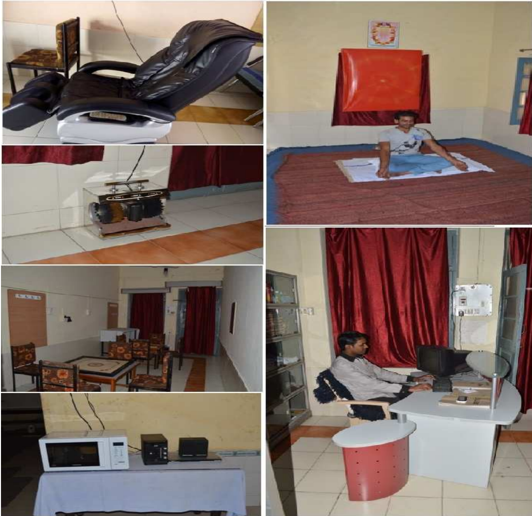
Facilities in Running Room-COR

Massage chair, Shoe polisher, Meditation room, Recreation room,, Computerized reception