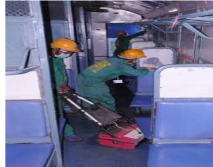
Mechanized Cleaning of Primary maintained trains