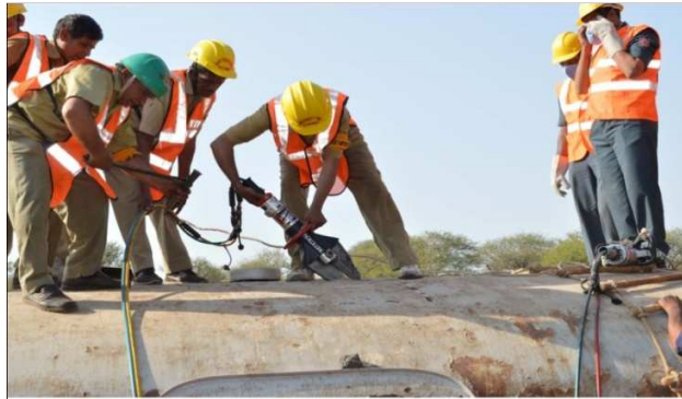
Coach cutting trial by Break down staff for rescue operation