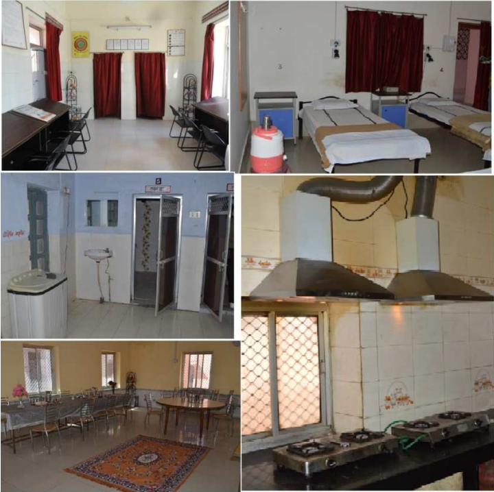
Inside View of Running Room-COR