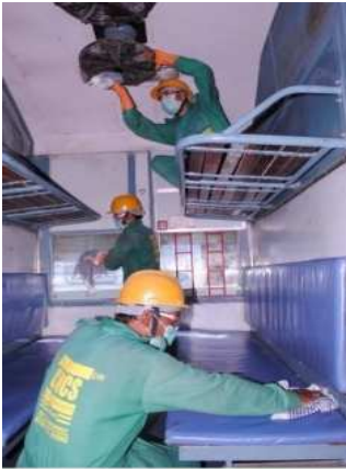
Mechanized Cleaning of Primary maintained trains