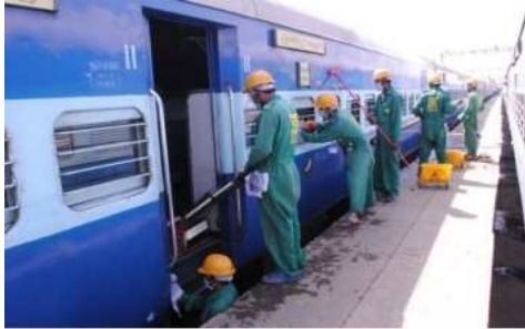
Mechanized Cleaning of Primary maintained trains