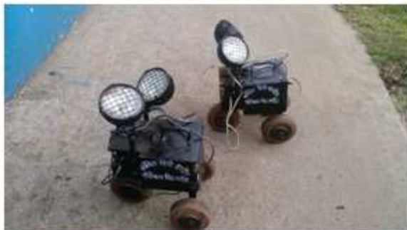
Portable pit lights innovated by Coaching Depot-IND