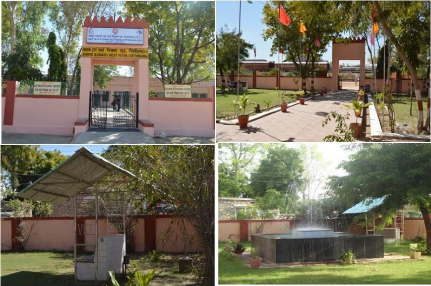
Out side and garden area of Running Room COR