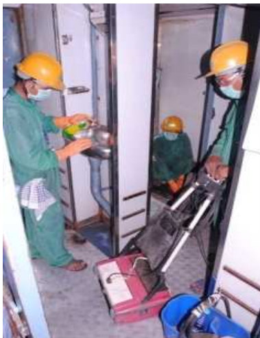
Mechanized Cleaning of Primary maintained trains