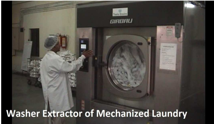
Washer Extractor of Mechanized Laundry