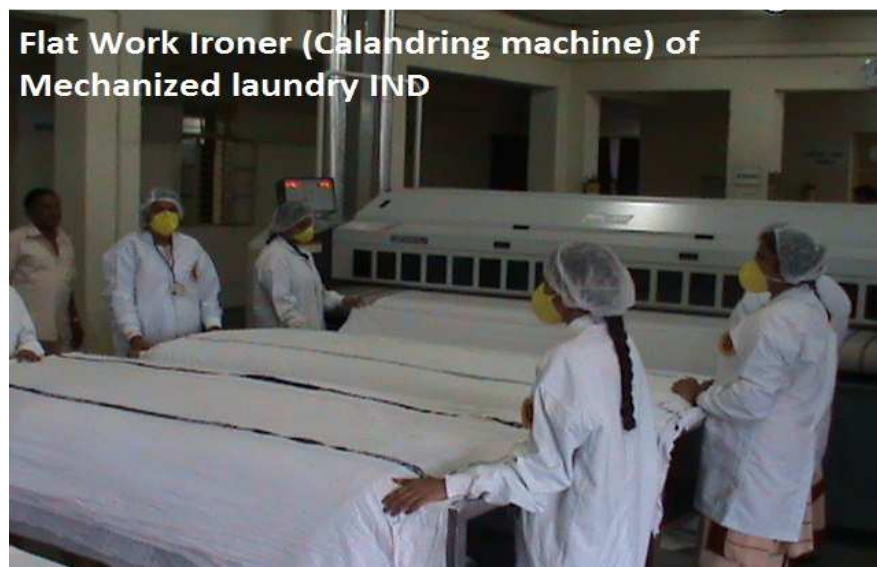
Flat Work Ironer (Calandring machine) of Mechanized laundry IND