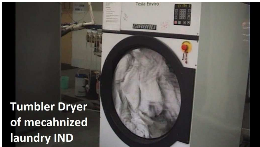
Tumbler Dryer of mecahnized laundry IND